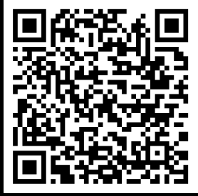
Photo Shoot with Apple Snaps

Sunday May 18, 2025 Saturday May 24, 2025